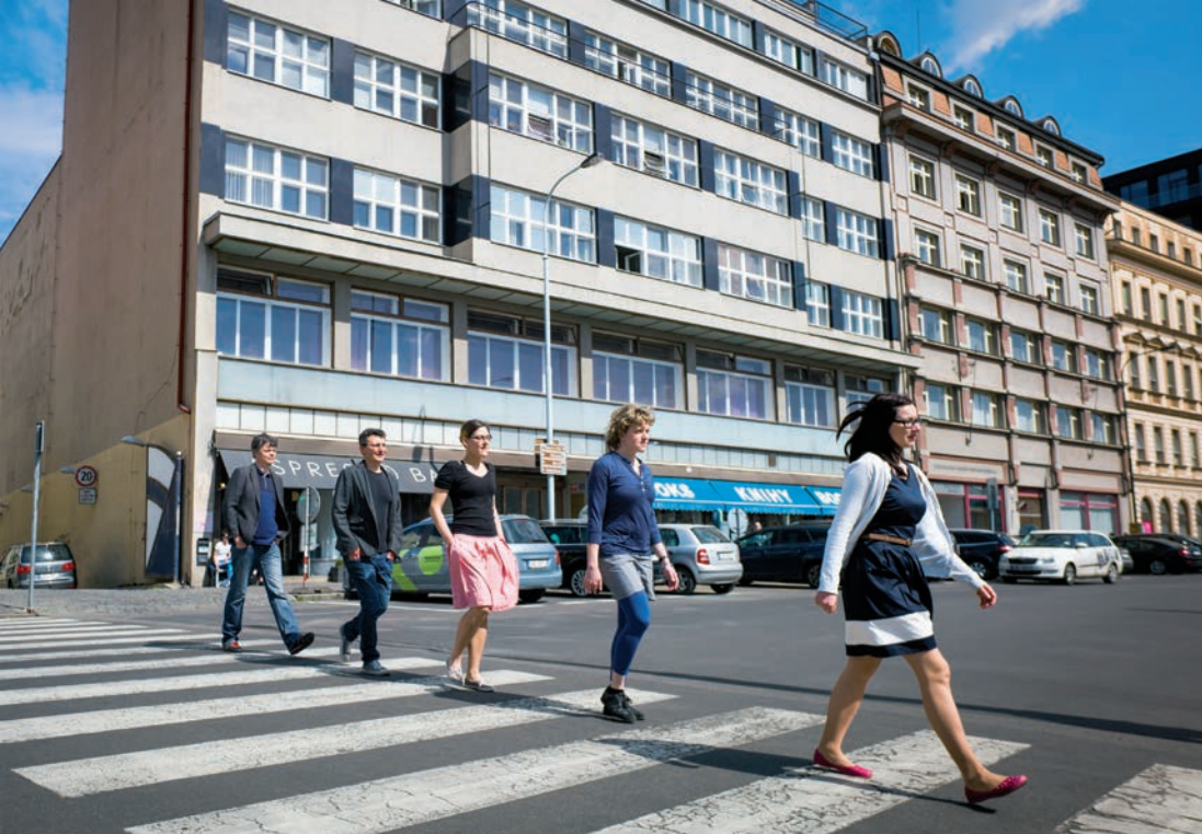
Outside the present-day ICL premises, Na Florenci Street